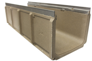
AS3000 STAINLESS STEEL EDGE POLYMER CONCRETE CHANNEL

With superior hygienic qualities, Hydro's stainless steel poolside grates easily meet the durability and anti-corrosive requirements of this busy outdoor swimming area. Hydro's stainless steel grates deliver on the aesthetic brief expected of a modern aquatic centre, while the added Suregrip nodules ensure smooth trafficability for pedestrians and swimmers for years to come.