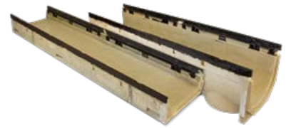
C2000 CAST IRON EDGE POLYMER CONCRETE CHANNEL

With Hydro Supreme polymer concrete drainage channels, integrating high-quality drainage performance, reliability, and aesthetics is achievable. Available in two designs, Hydro's unique polymer concrete trench drainage solutions can be integrated with a galvanised steel edge or stainless steel edge rail. Manufactured from natural mineral products including quartz, basalt and granite, these polymer concrete channels are built to last in terms of function and benefits for the public and environment. For more information contact the team on 1300 GO HYDRO or visit www.hydrocp.com.au .