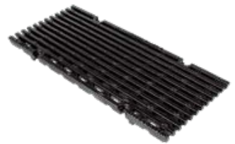
223M DUCTILE IRON LONGITUDINAL HEELGUARD GRATE